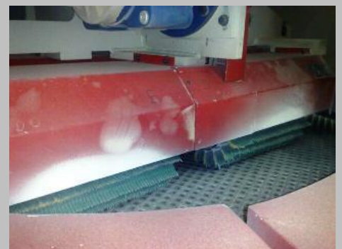
The sanding heads in the round about brush sander were replaced with sanding heads from Flex Trim.

The result is among others a four times longer lifetime