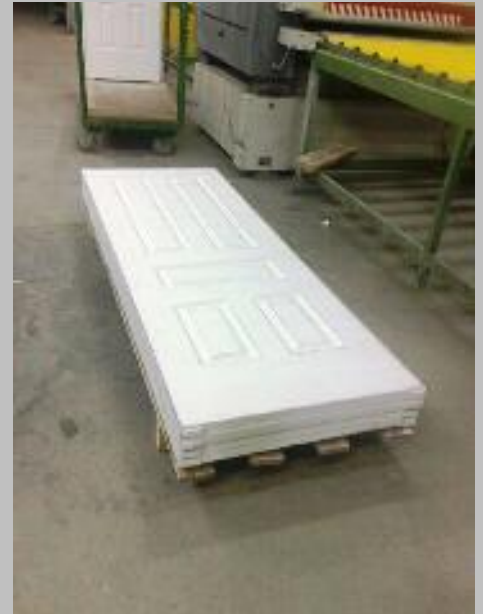
The Spanish door producer, Bricoblock, has installed a successful solution from Flex Trim for wood sanding on doors of MDF with CNC-milled grooves, before lacquering them white.