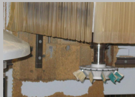
Sanding solution implemented on a CNC machine.