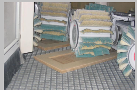
Brush sander equipped with Flex Trim sanding heads and sanding strips.