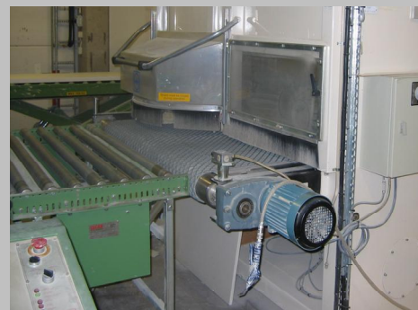
Brush sanding machine.