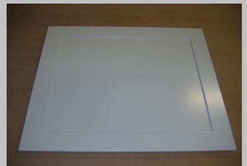
Finished, white-painted MDF door.